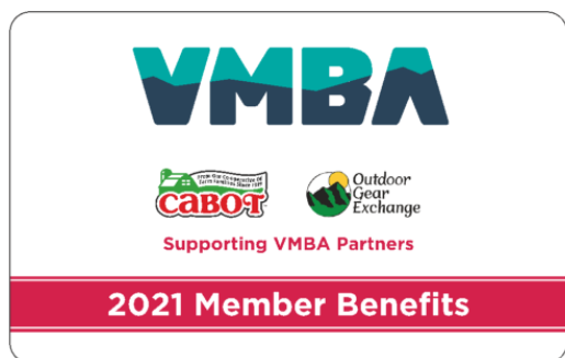
CMYK MATTE LAMINATION 3.375" x 2.125"

VMBA Members can start to redeem their 2021/22 benefits from April 1, 2021 - March 31, 2022. This year, our color is pink! Every member receives the card featured below with their name on it. As of April 1st, if a member shows you a different colored card - it is no longer active.